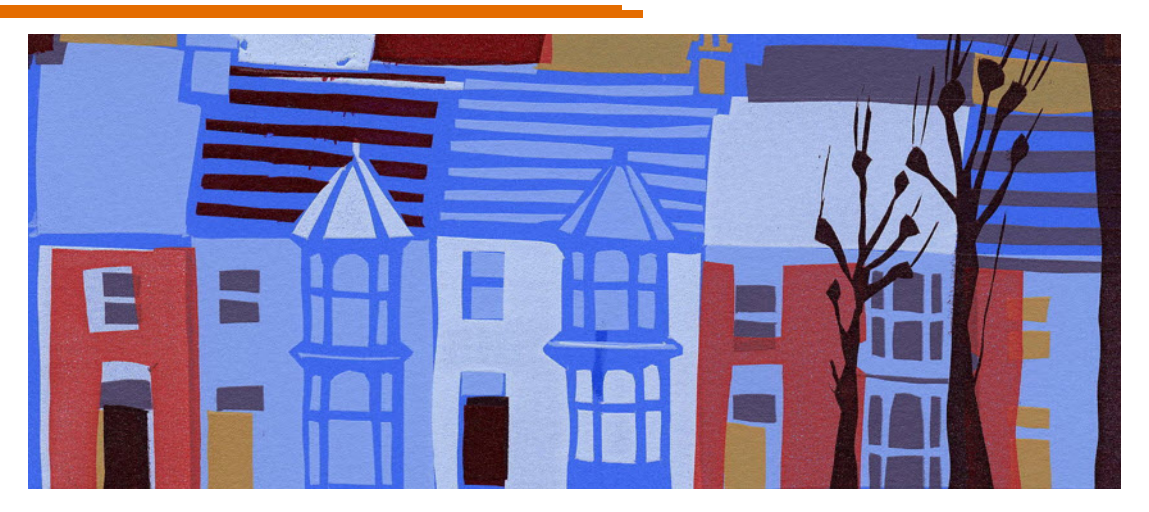
Sarah Hopkins | Uplands | screenprint | detail